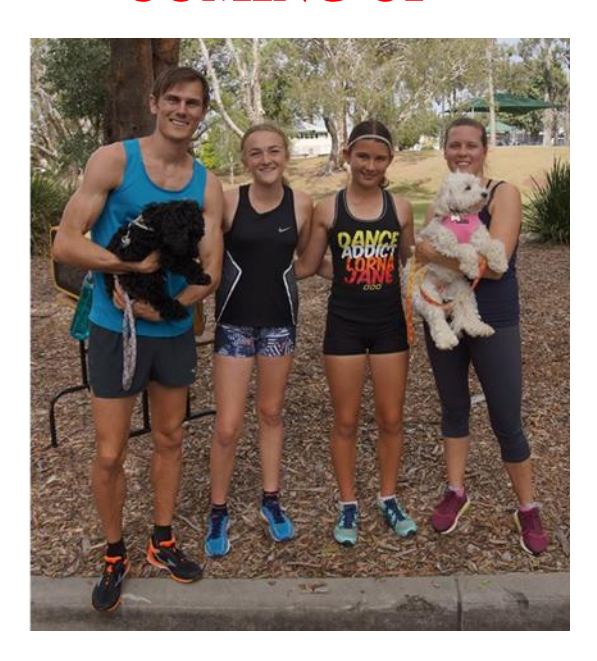
Dream Team plus mascots